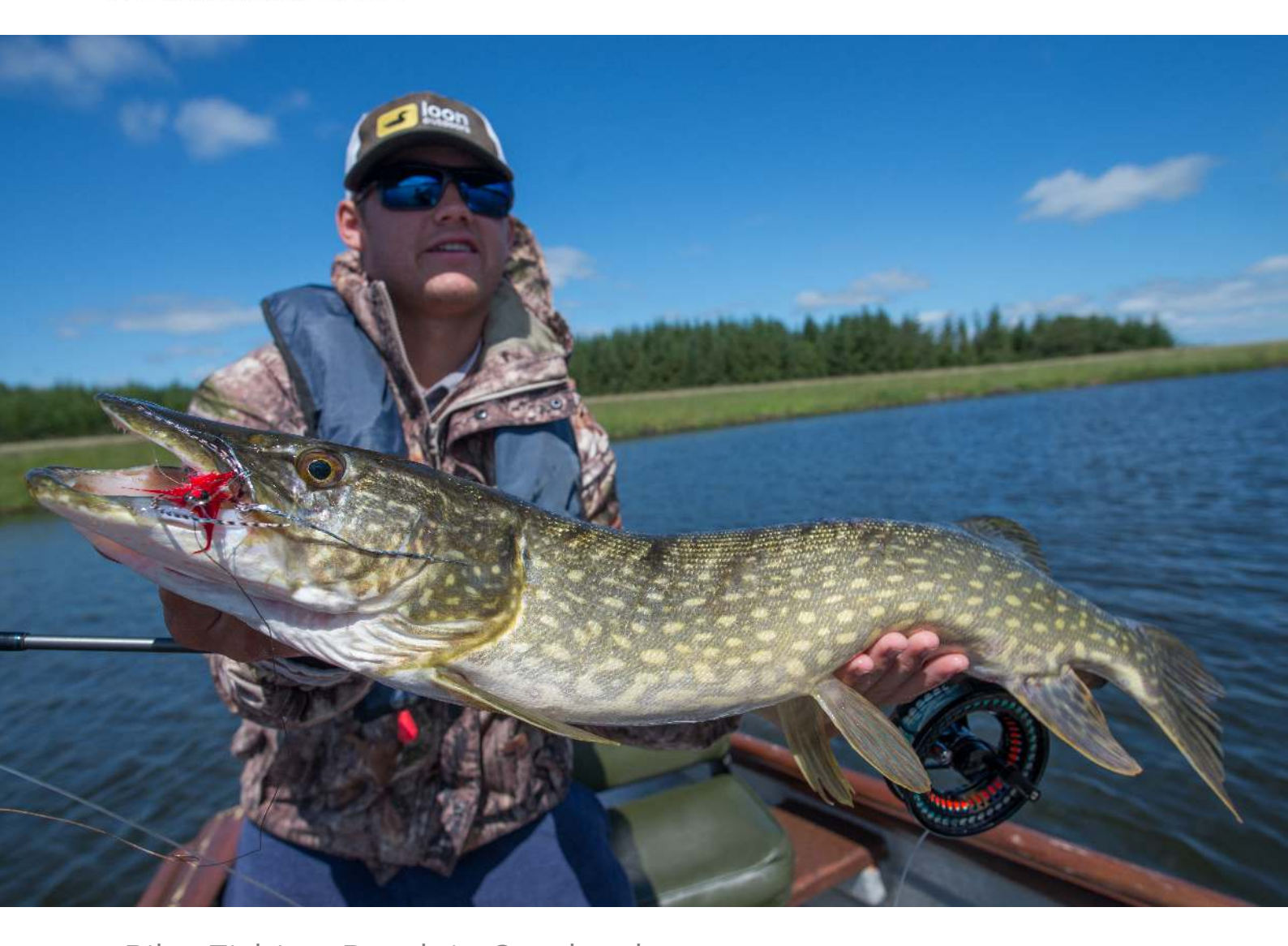
Pike Fishing Break in Scotland

Fishing Breaks in Scotland's finest fishing locations